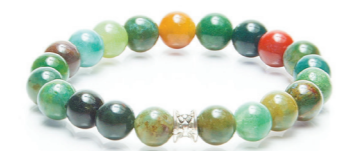
Indian Summer 8mm