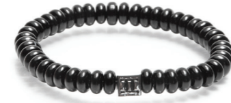
Evening Silver 8mm