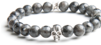
Skull Grey 8mm