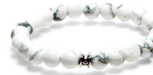
Basic Mat White 8mm