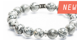
Urban Grey 10mm