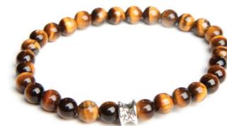
Tiger Eye 6mm