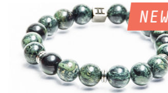
Urban Green 10mm