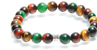
3 Colours New 8mm