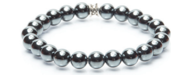
Dark Silver 8mm