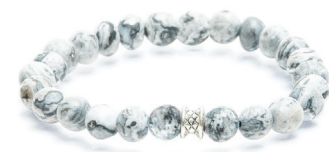
Basic Mat Grey 8mm