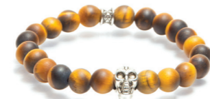
Skull Mat Tiger Eye 8mm