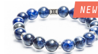
Urban Blue 10mm