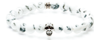
Skull White 8mm