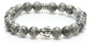
Buddha Grey 8mm