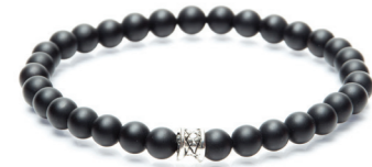
Mat Black 6mm