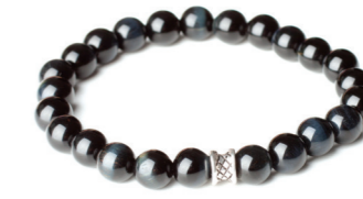
Dark Blue 8mm