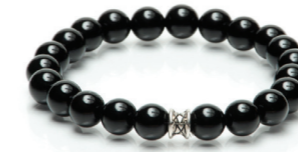
Basic Black 8mm