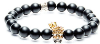
Yellow Gold Skull 8mm