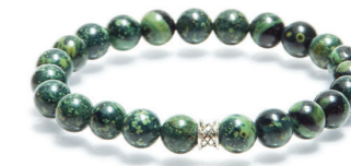
Basic Green 8mm