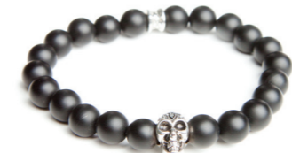
Skull Mat Black 8mm