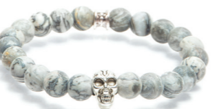
Skull Mat Grey 8mm