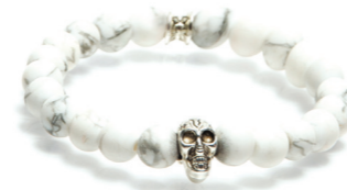
Skull Mat White 8mm