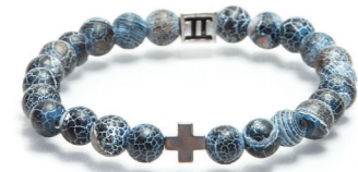
Summer Dark Blue 8mm