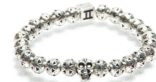
Skull Metal 8mm