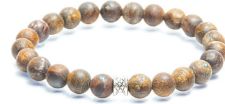
Basic Mat Brown 8mm