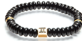
Evening Gold 8mm