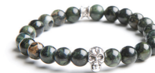
Skull Green 8mm