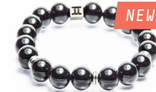
Urban Black 10mm