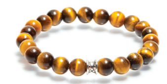
Tiger Eye 8mm