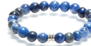
Basic Blue 8mm