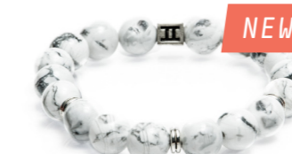
Urban White 10mm