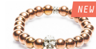
Skull Copper 8mm