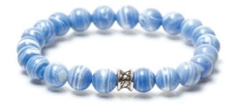
Light Blue 8mm