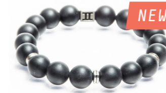
Urban Mat Black 10mm