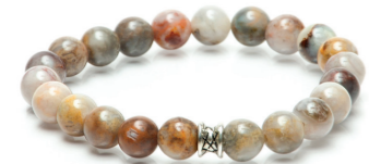
Crazy Grey 8mm