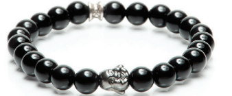
Buddha Black 8mm