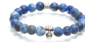
Skull Mat Blue 8mm