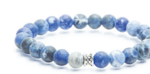
Basic Mat Blue 8mm