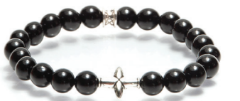
Cross Black 8mm