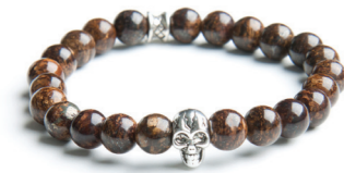
Skull Brown 8mm