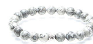
Basic Grey 8mm