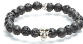
Skull Black Lava 8mm