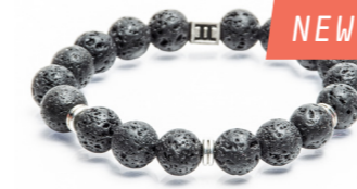
Urban Black Lava 10mm