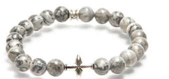
Cross Dark Grey 8mm