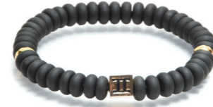
Evening Gold Mat 8mm