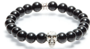
Skull Black 8mm