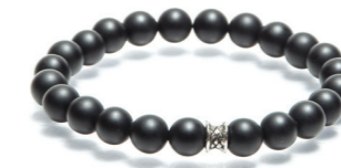
Basic Mat Black 8mm