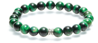
Dark Green 8mm