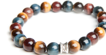
3 Colours 8mm