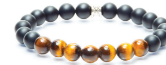
Black / Yellow 8mm