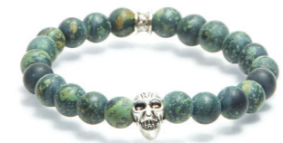
Skull Mat Green 8mm