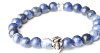
Skull Blue 8mm