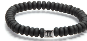
Evening Silver Mat 8mm