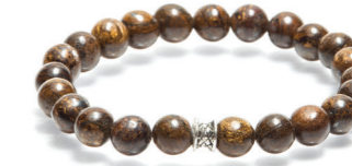
Basic Brown 8mm