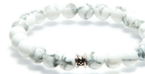
Basic White 8mm