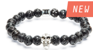
Skull Black Metal 8mm