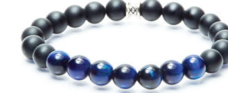
Black / Dark Blue 8mm