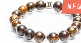
Urban Brown 10mm