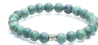
Basic Mat Green 8mm