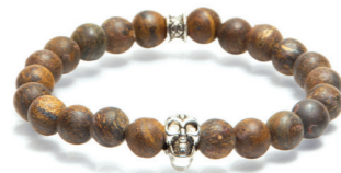
Skull Mat Brown 8mm