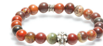
Skull Vulcano 8mm