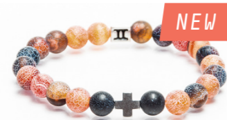
Winter Red 8mm