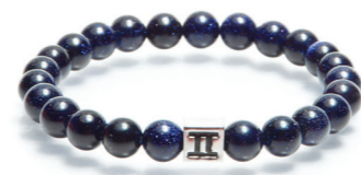
Summer Night 8mm